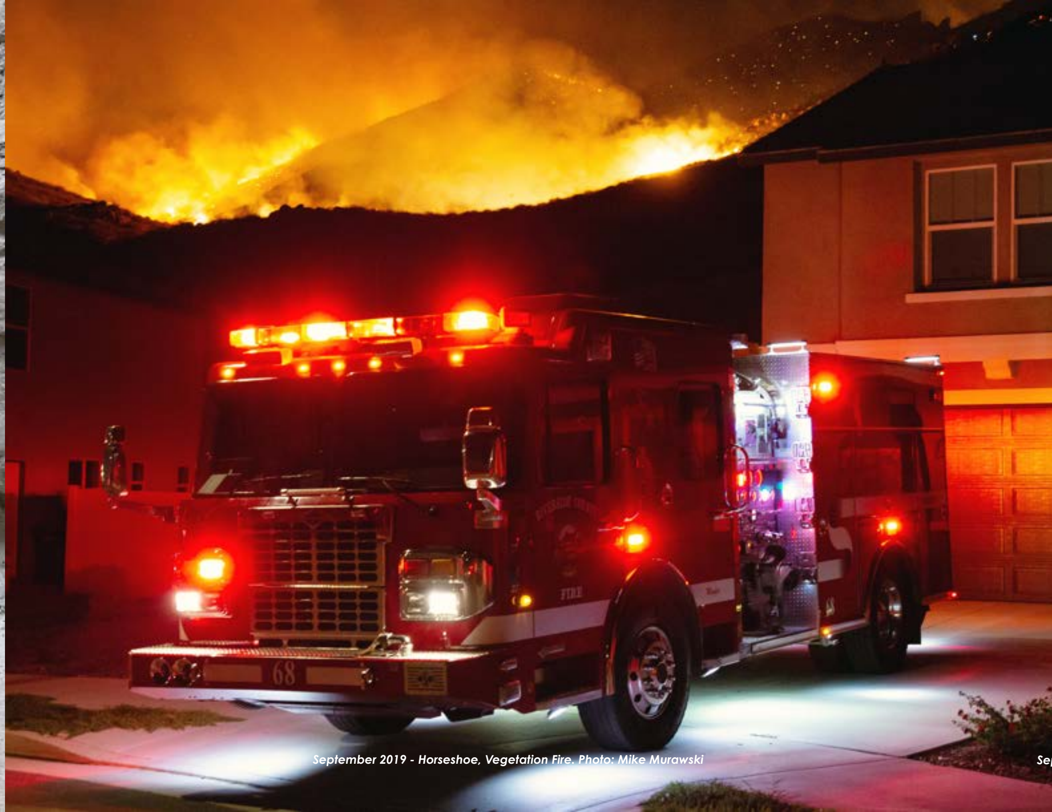
September 2019 - Horseshoe, Vegetation Fire.