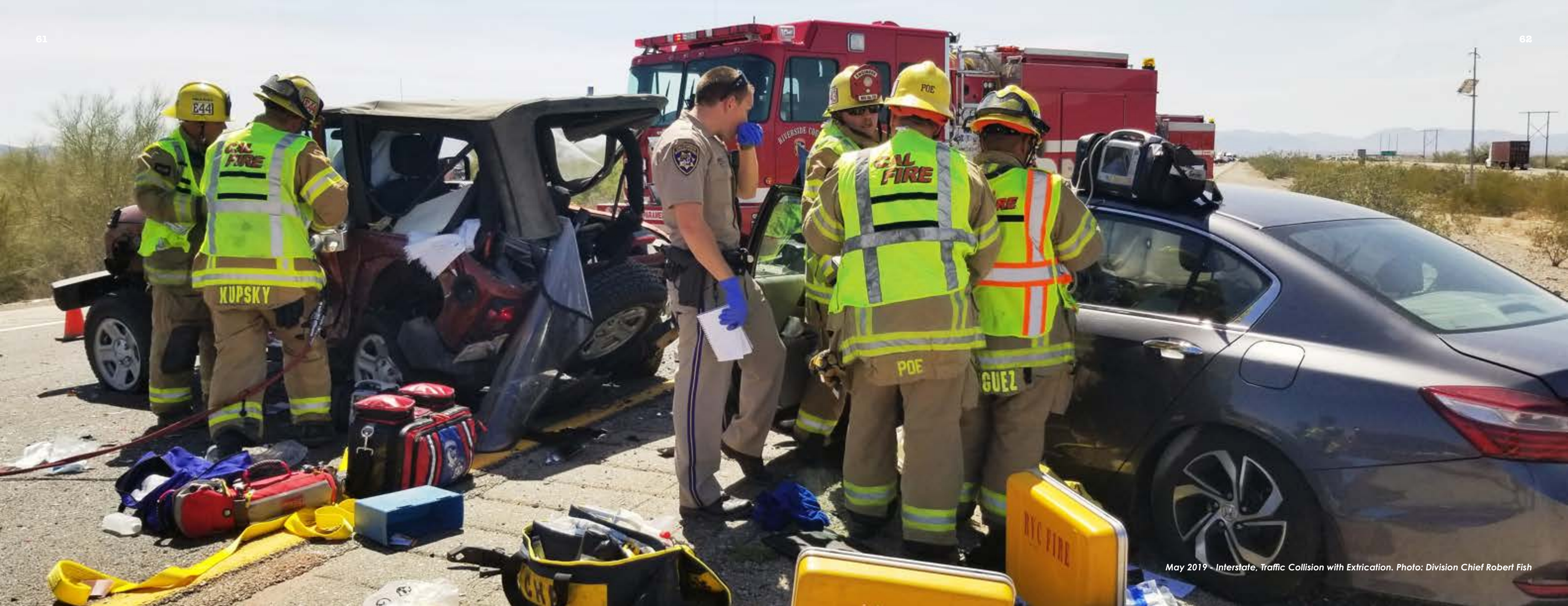
May 2019 - Interstate, Traffic Collision with Extrication.