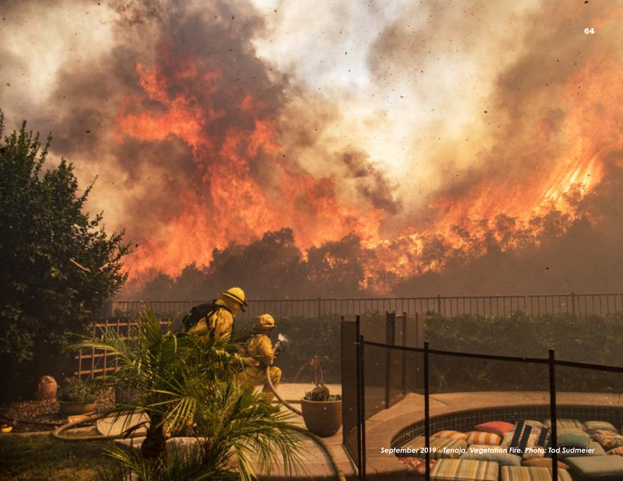
September 2019 - Tenaja, Vegetation Fire.