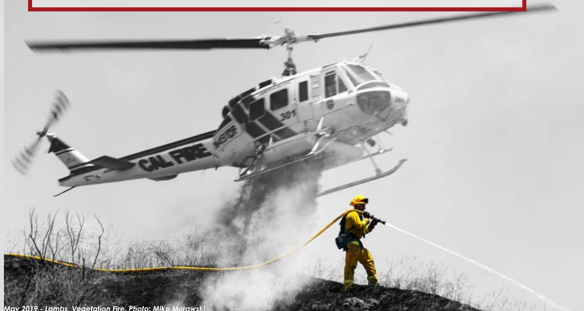
May 2019 - Lambs, Vegetation Fire.