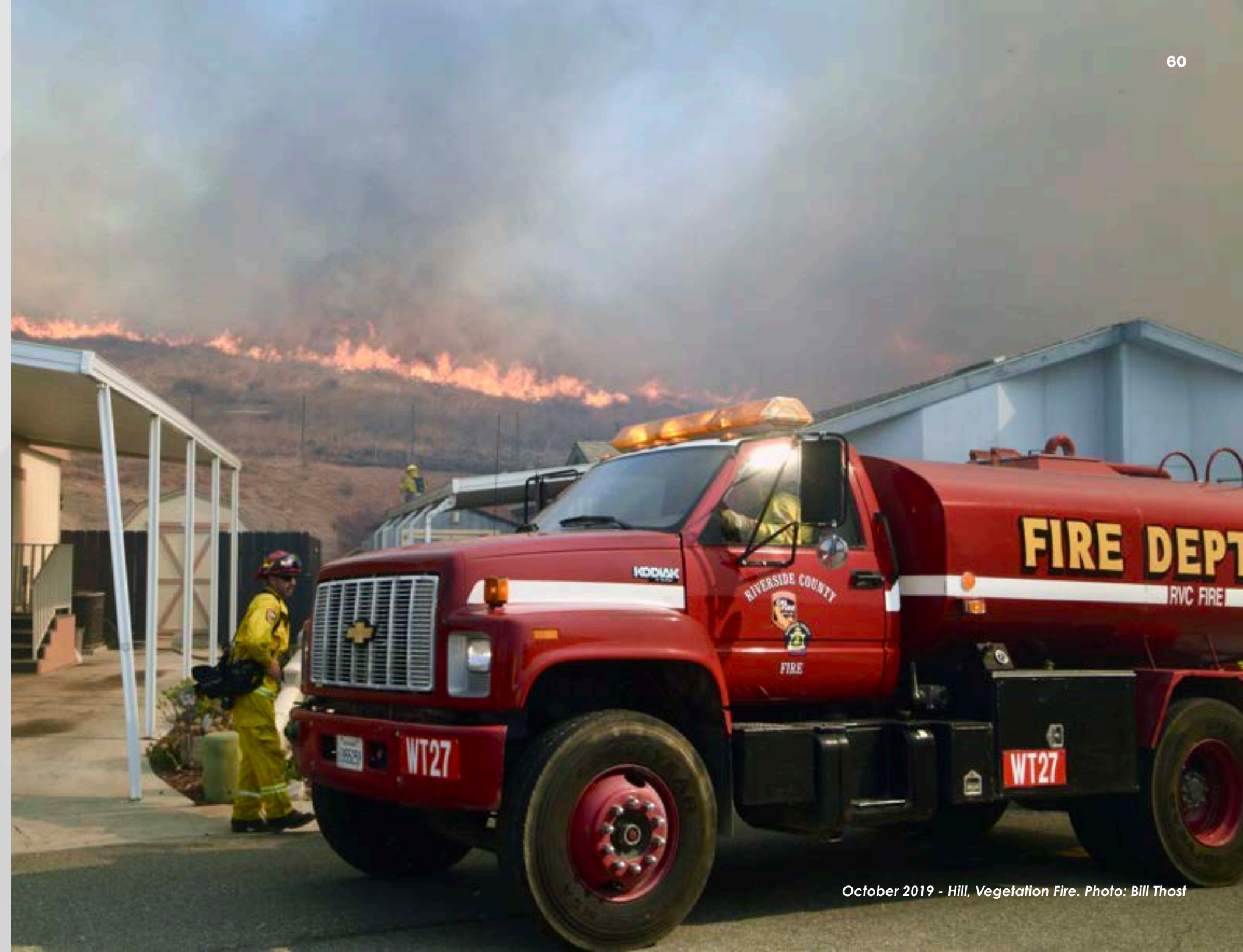
October 2019 - Hill, Vegetation Fire.