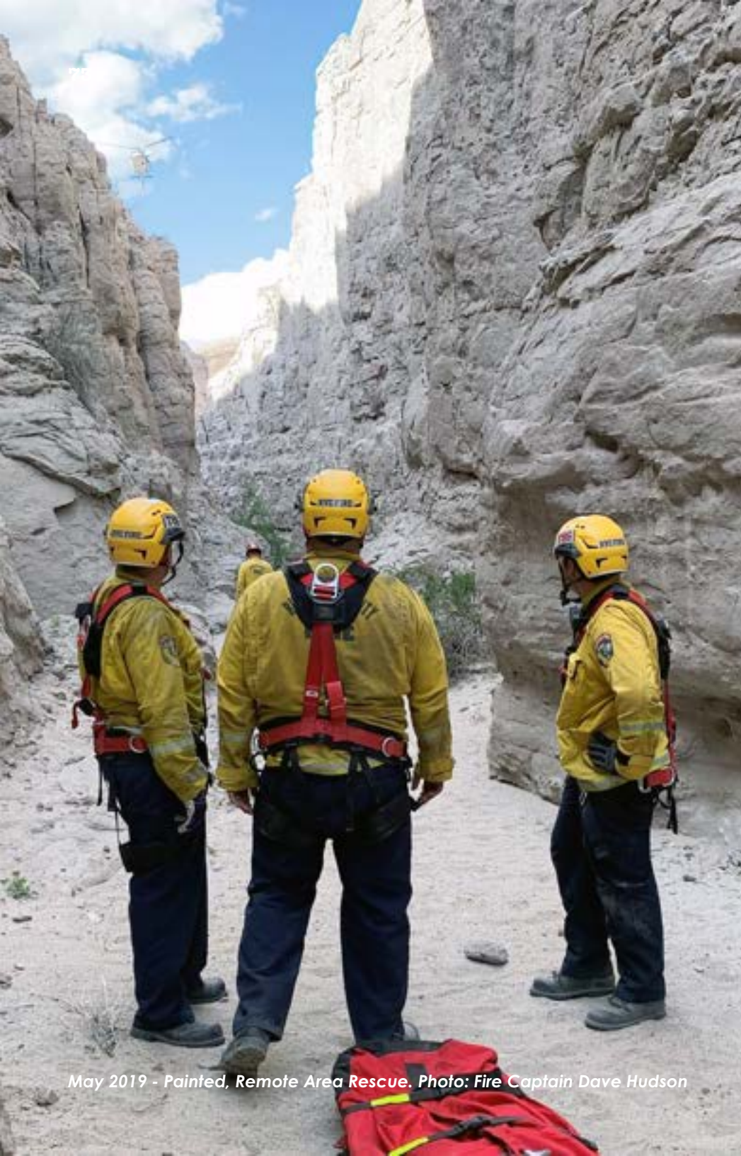
May 2019 - Painted, Remote Area Rescue.