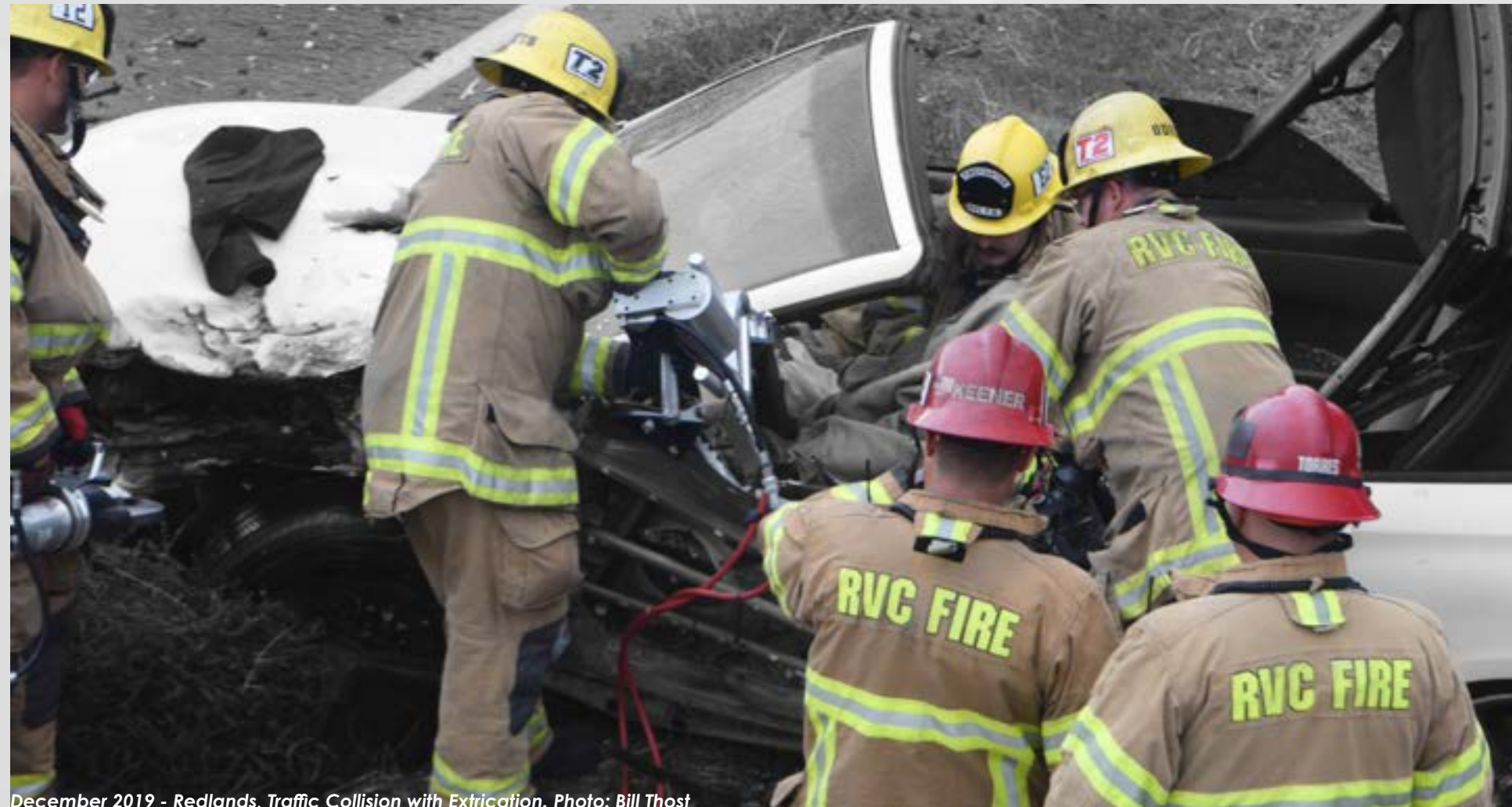
December 2019 - Redlands, Traffic Collision with Extrication.