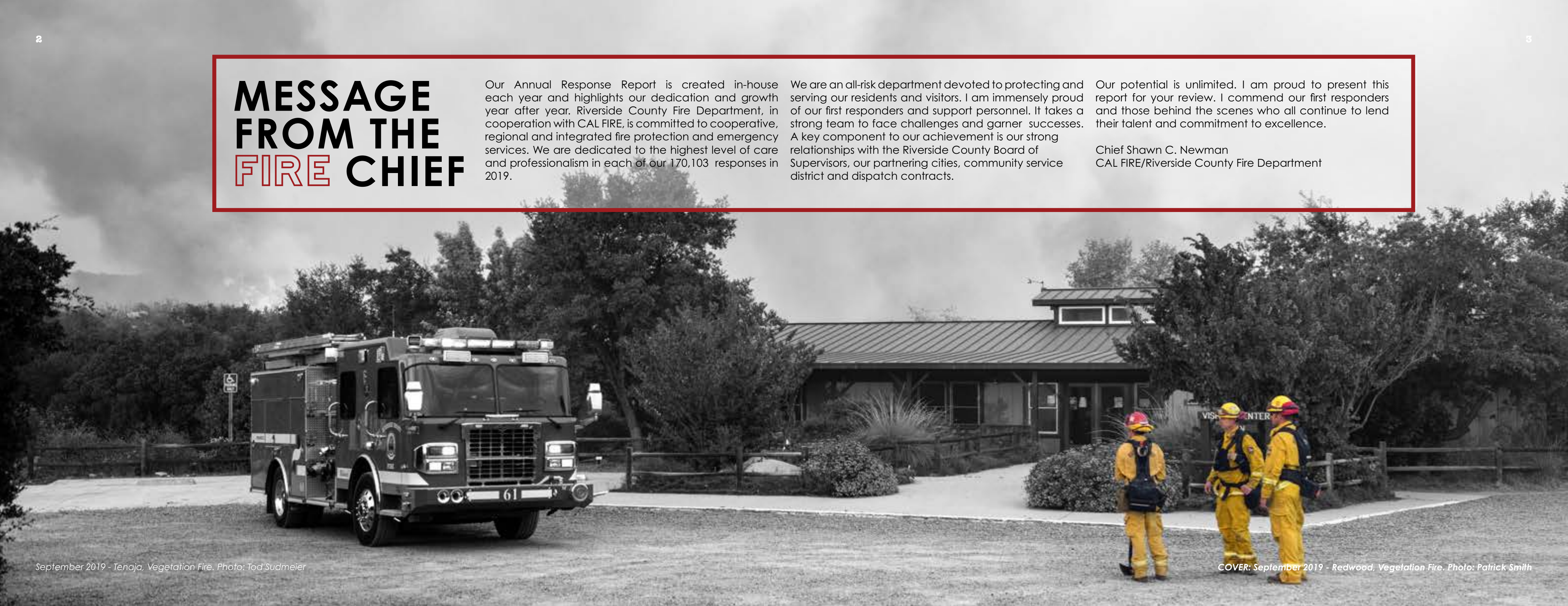
September 2019 - Tenaja, Vegetation Fire.

Chief Shawn C. Newman CAL FIRE/Riverside County Fire Department