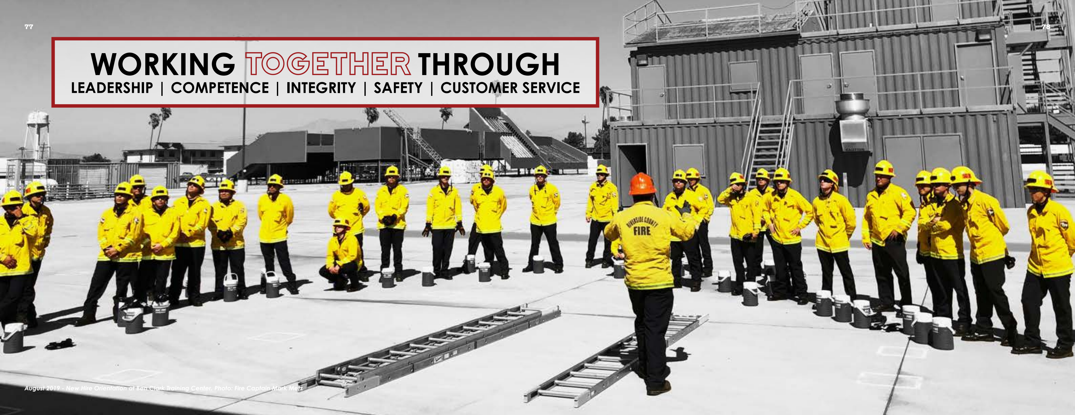
August 2019 - New Hire Orientation at Ben Clark Training Center.