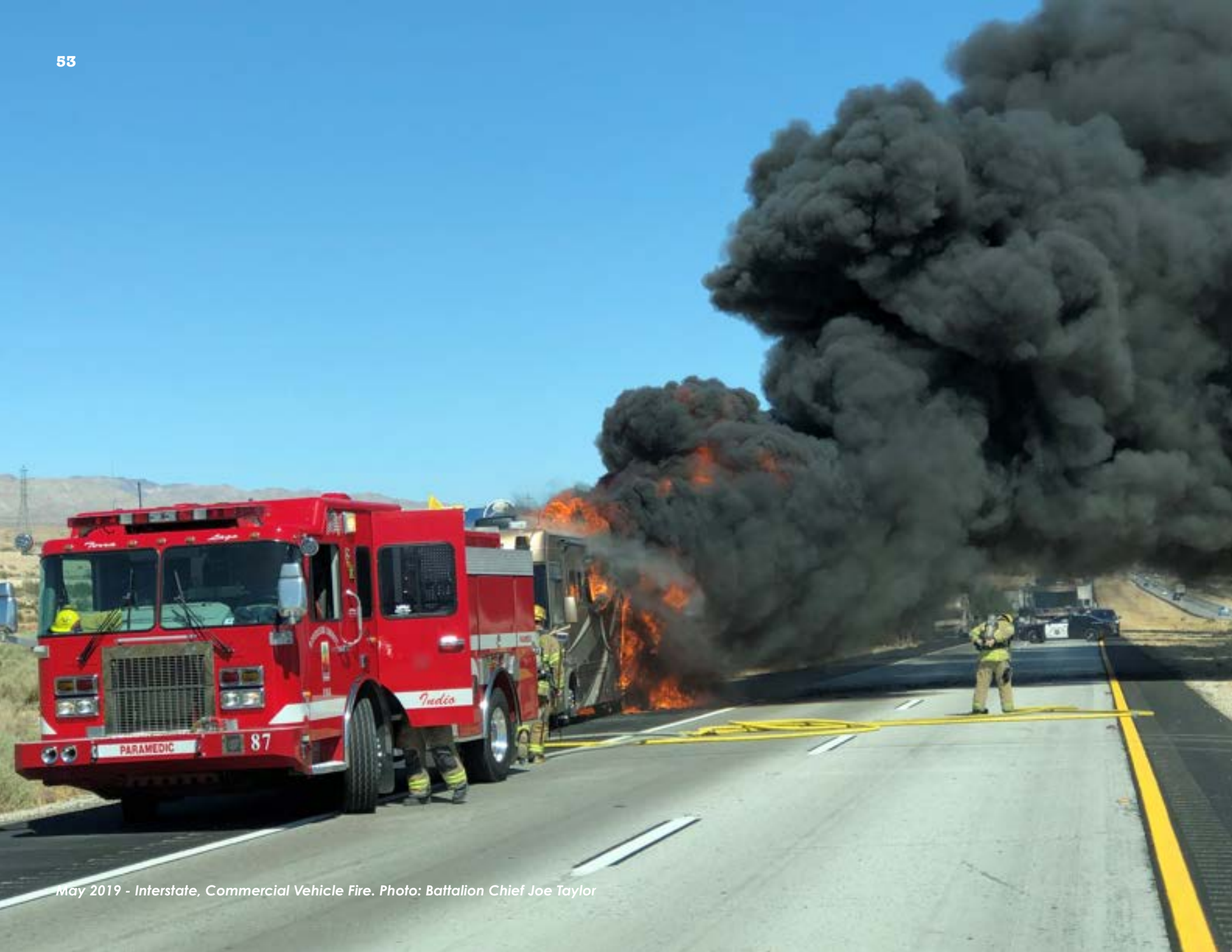
May 2019 - Interstate, Commercial Vehicle Fire.