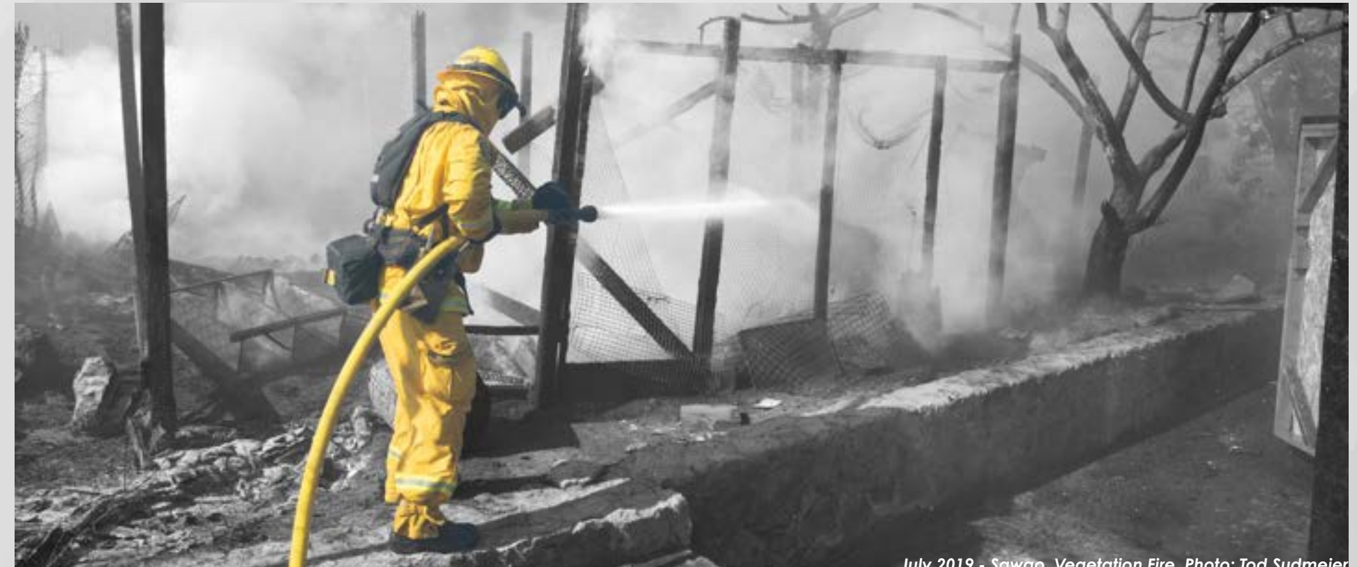
July 2019 - Sawgo, Vegetation Fire.