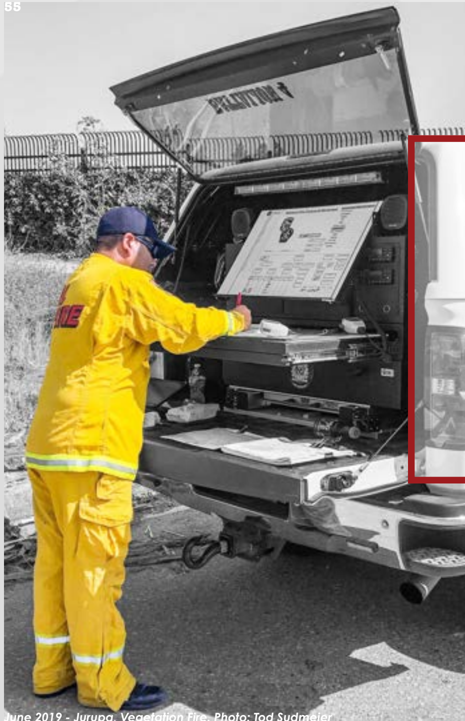
June 2019 - Jurupa, Vegetation Fire.