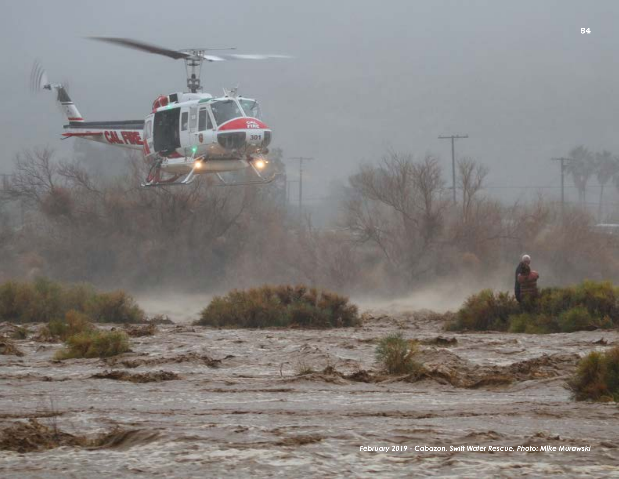
February 2019 - Cabazon, Swift Water Rescue.