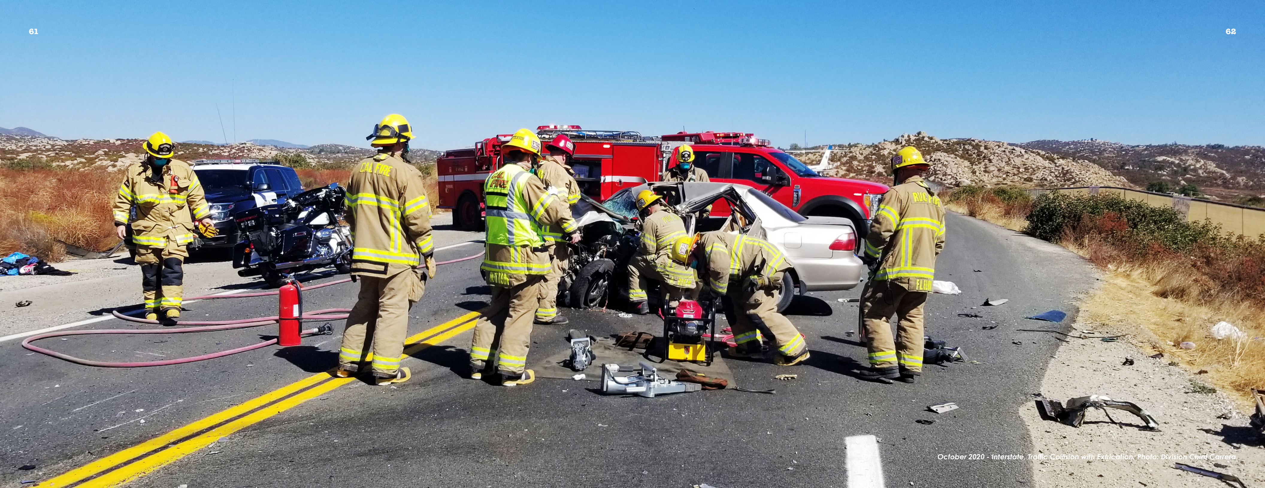
October 2020 - Interstate Traffic Collision with Extrication.