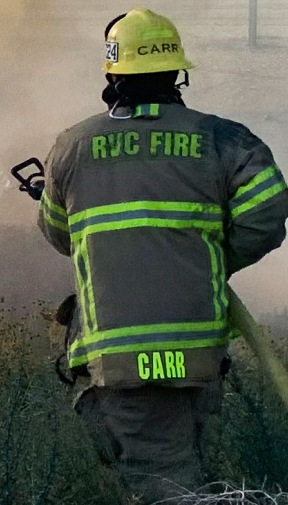
May 2020 - Gilman, Commercial Vehicle Fire into the Vegetation.