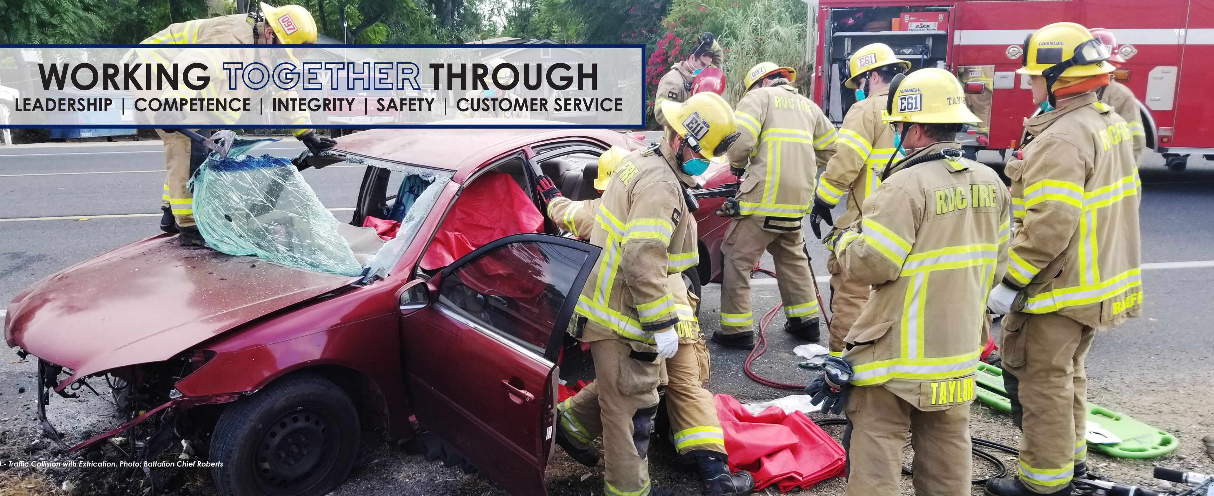
August 2020 - Traffic Collision with Extrication.