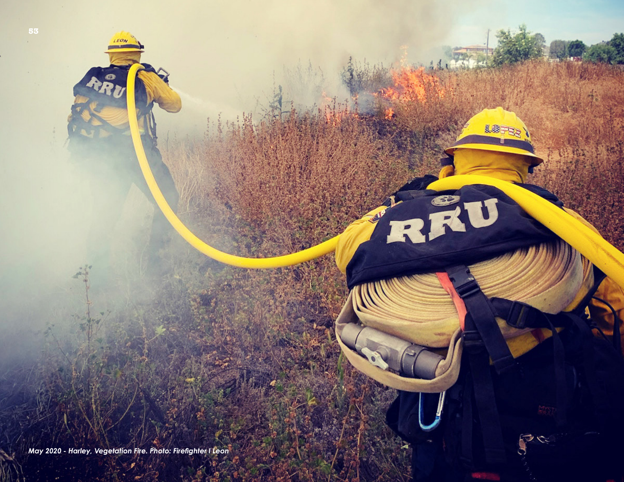
May 2020 - Harley, Vegetation Fire.