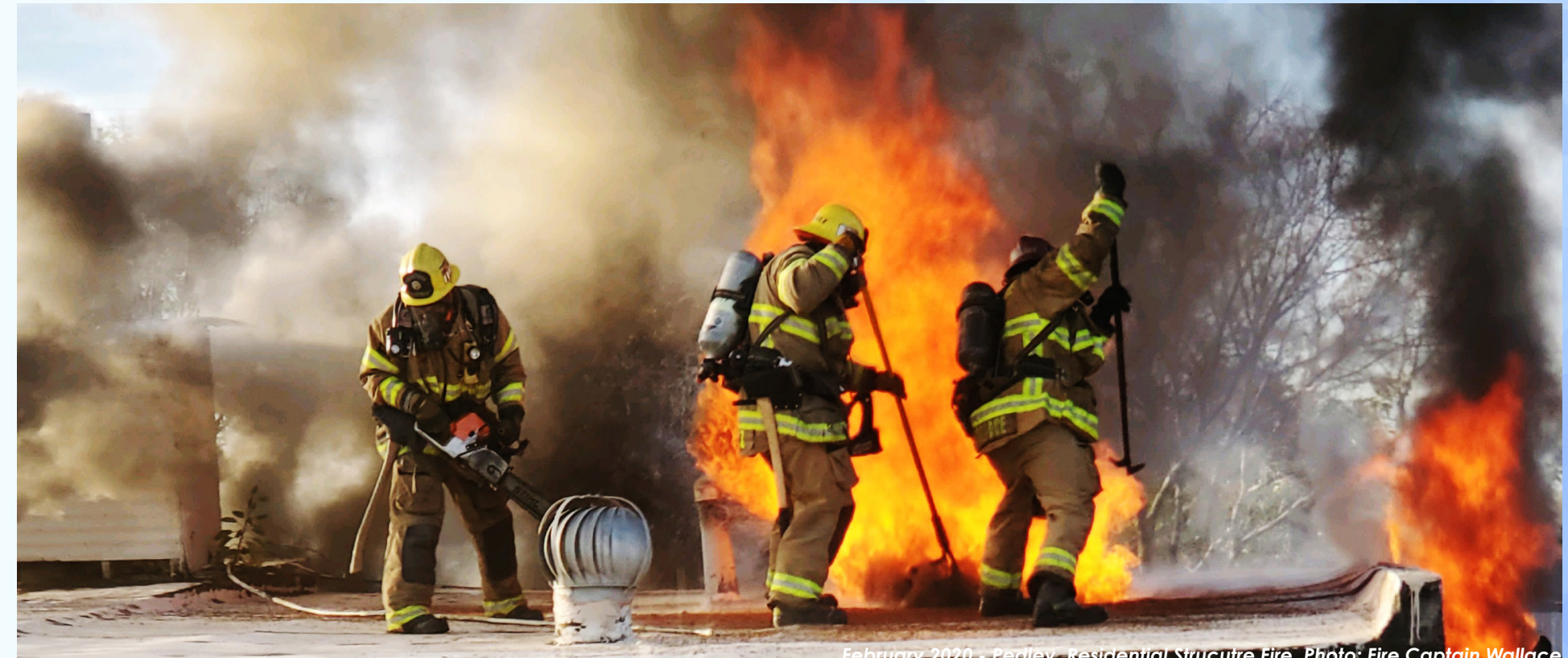
February 2020 - Pedley, Residential Structure Fire.