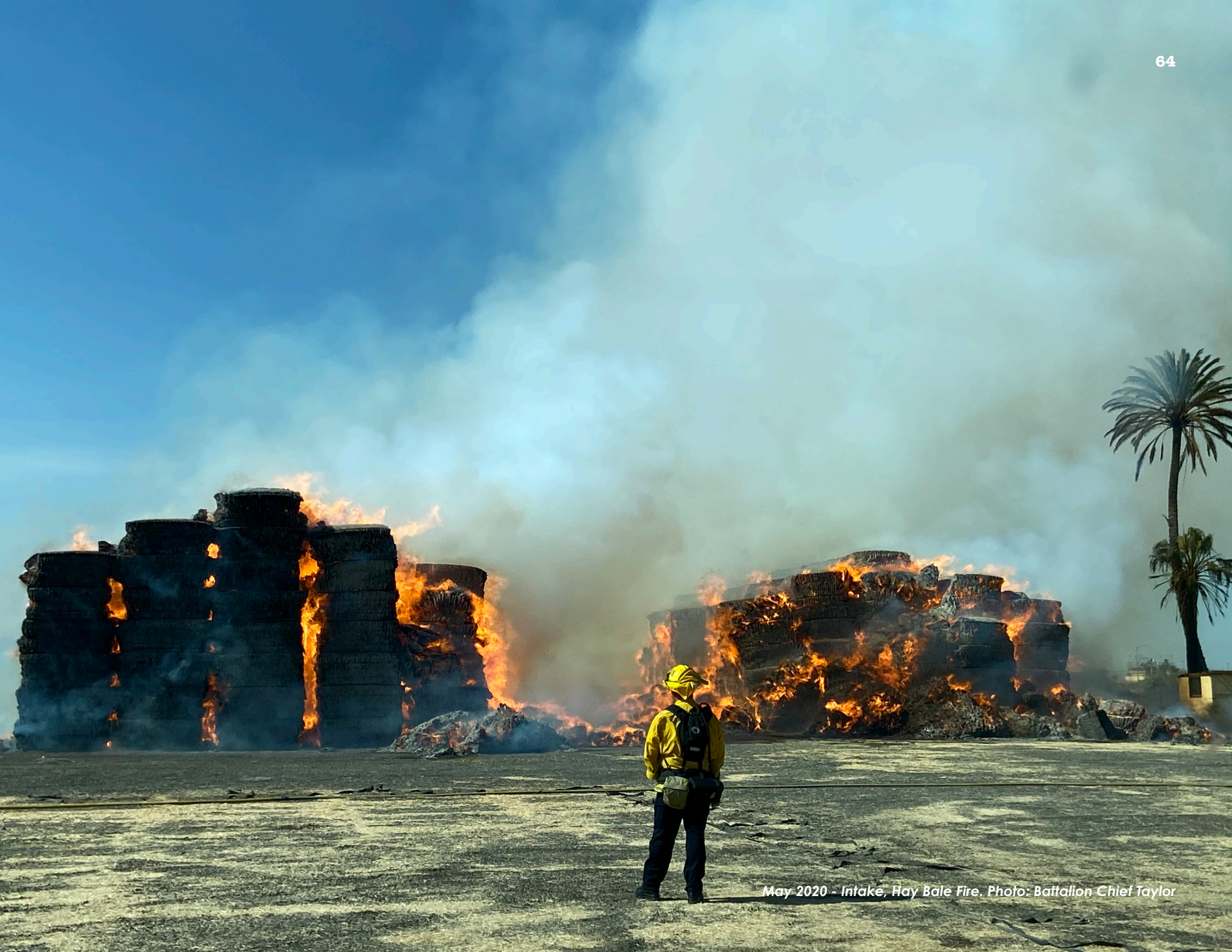
May 2020 - Intake, Hay Bale Fire.