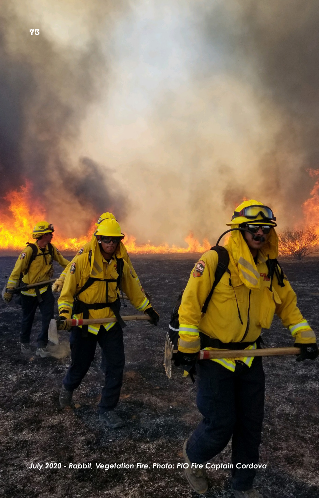
July 2020 - Rabbit, Vegetation Fire.