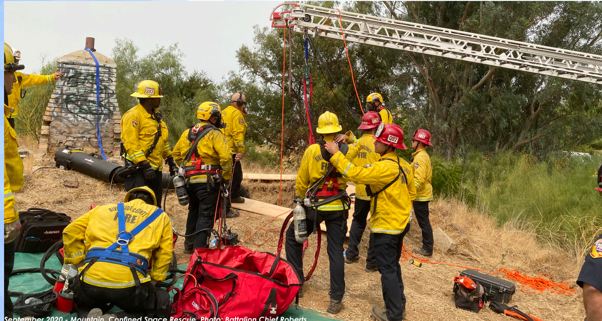
September 2020 - Mountain, Confined Space Rescue.