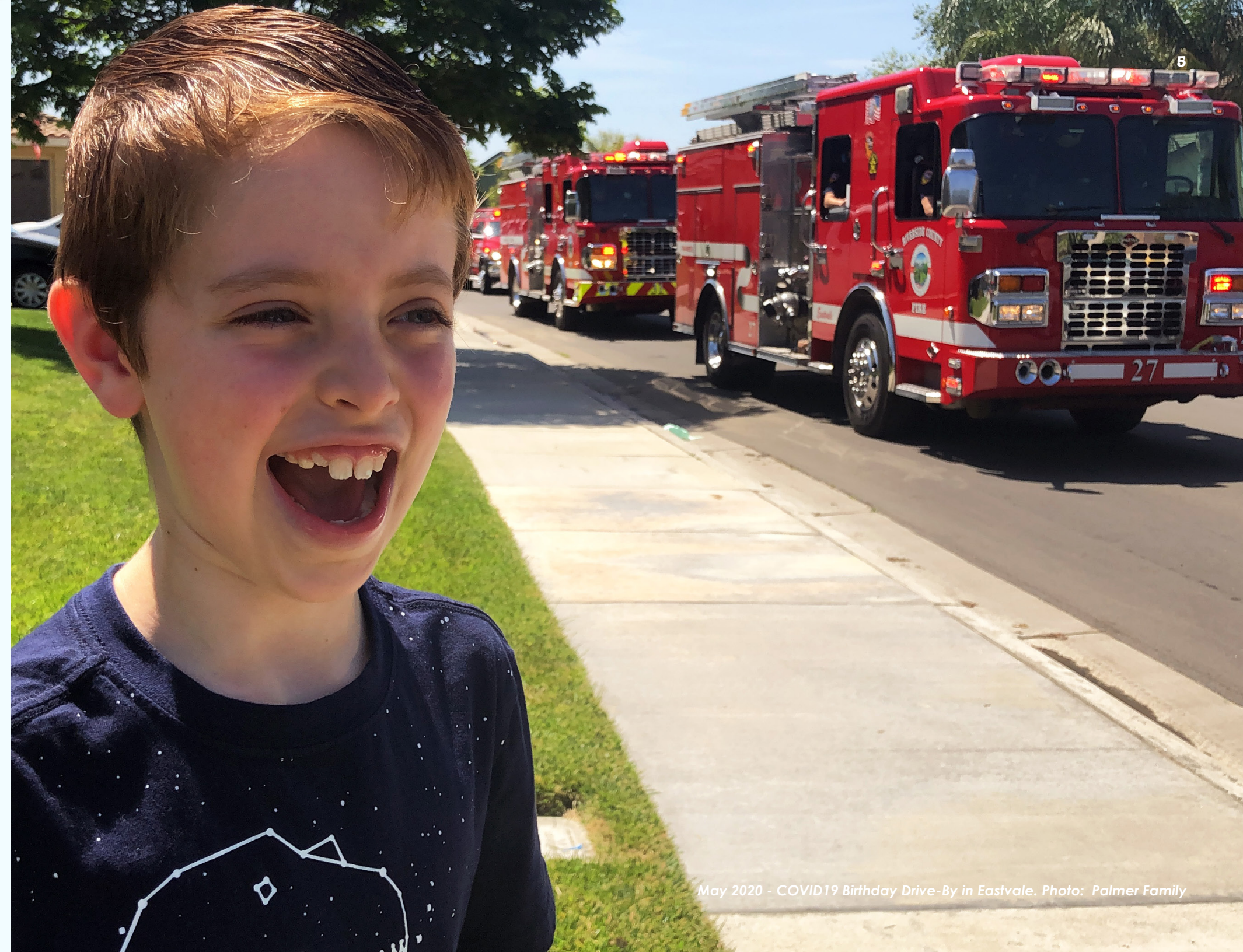
May 2020 - COVID19 Birthday Drive-By in Eastvale.