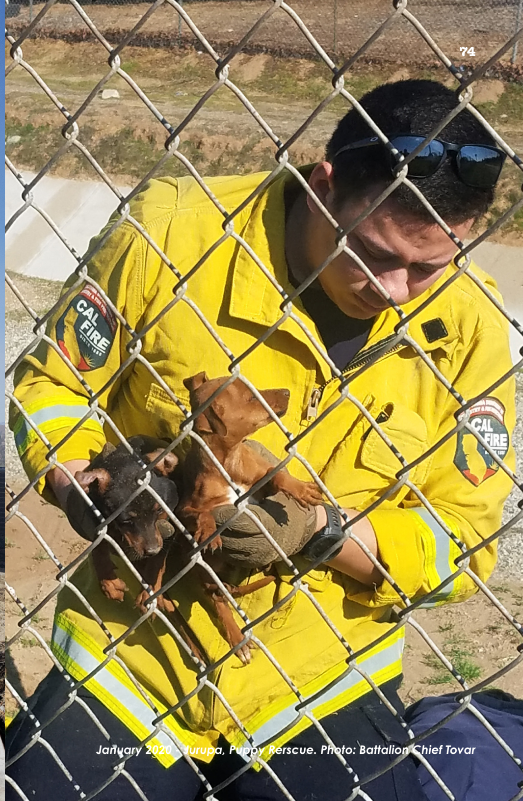
January 2020 - Turupa, Puppy Rescue.