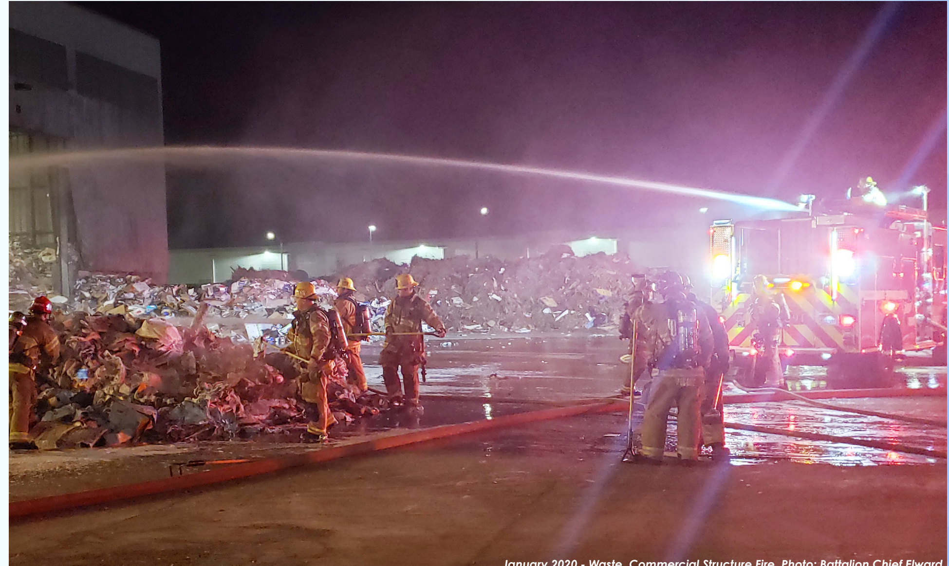
January 2020 - Waste, Commercial Structure Fire.