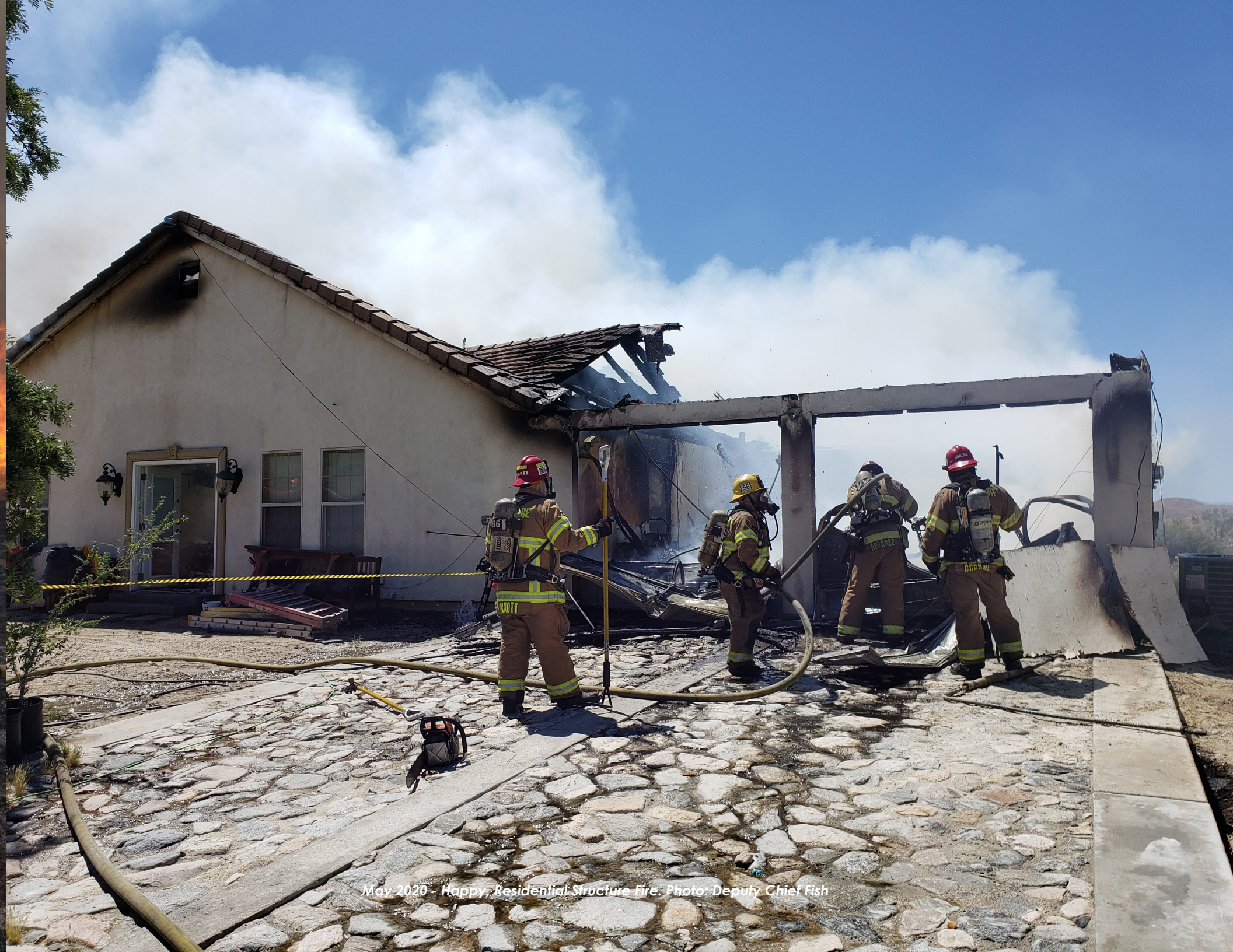
May 2020 - Happy, Residential Structure Fire.