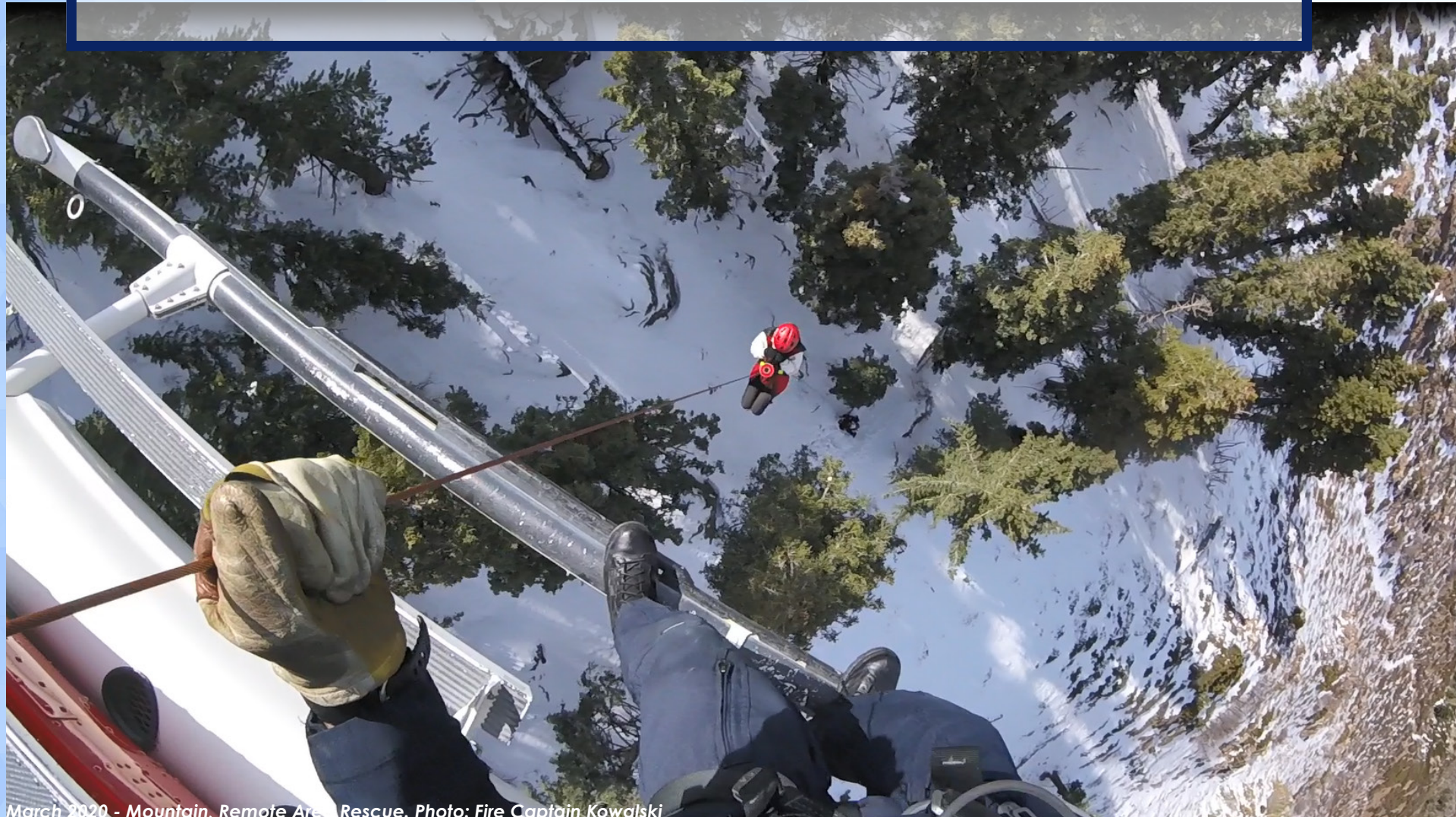
March 2020 - Mountain, Remote Area Rescue.