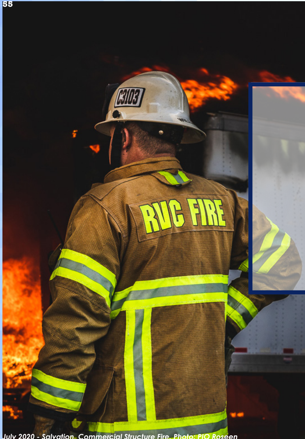
July 2020 - Salvation, Commercial Structure Fire.