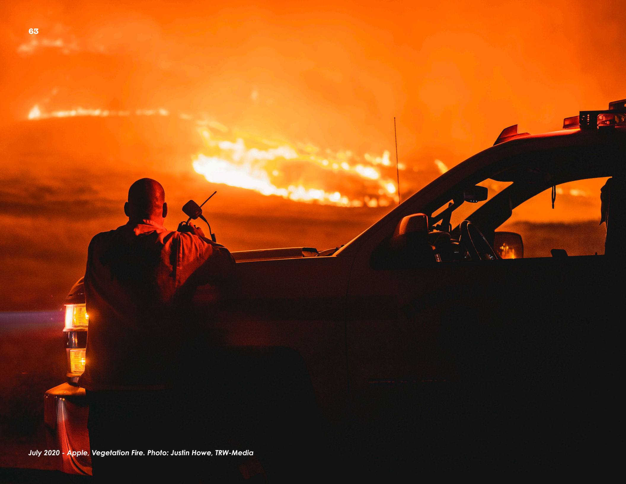
July 2020 - Apple, Vegetation Fire.